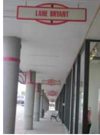
Illustration on the left shows under canopy sign and on the right a projecting sign

21.11 Building Directory – In addition to the wall signs otherwise permitted by these regulations an additional sign may be permitted up to a maximum of eight (8) square feet for the purpose of identifying first floor tenants that do not have outside building frontage or up- per floor tenants.